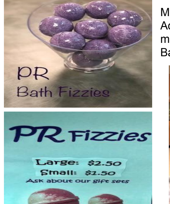
Mrs. Ortiz's Transition to Adulthood (TTA) classes are making and selling the PR Bath Fizzies

The health room is in need of supplies. Sign up to donate on the following link: <u>https://www.signupgenius.com/go/20F0845A5</u> <u>A72DAAFF2-supplies</u>